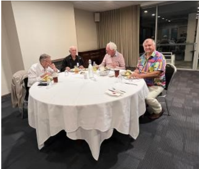
Some pictures from the meeting on 1 May